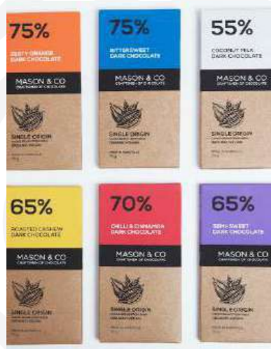
Kraft Chocolate Boxes