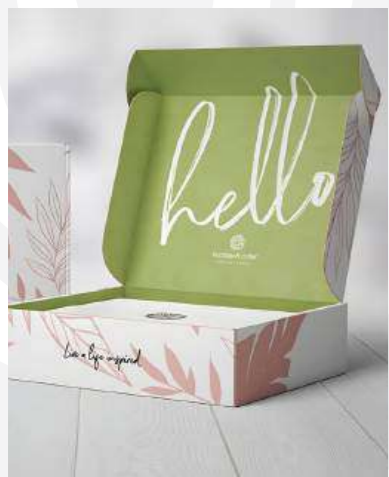
Both Side Mailer Box