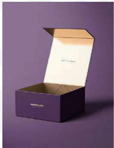
Flip Top Boxes