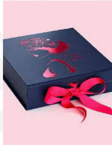
Rigid Gift Boxes