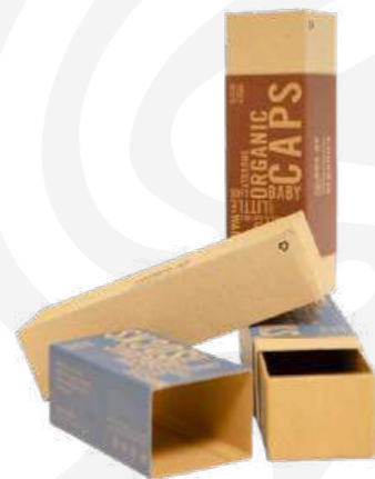
Kraft Sleeve Boxes