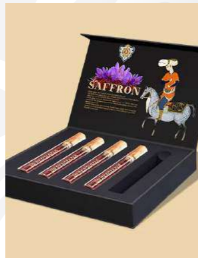
Hard Box Packaging