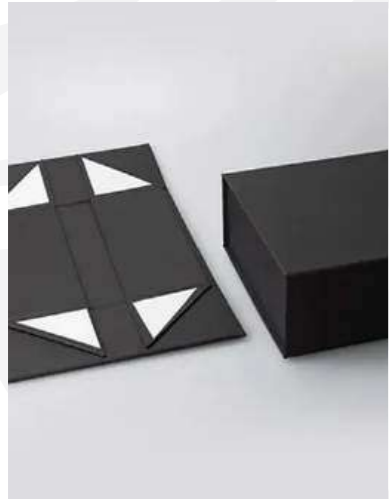
Foldable Rigid Boxes

Custom rigid boxes are premium solutions that make a lasting impression. Perfect for gifts, special occasions, or adding a touch of luxury to everyday items, our custom rigid packaging comes in various sizes, styles, and finishes to suit your needs.