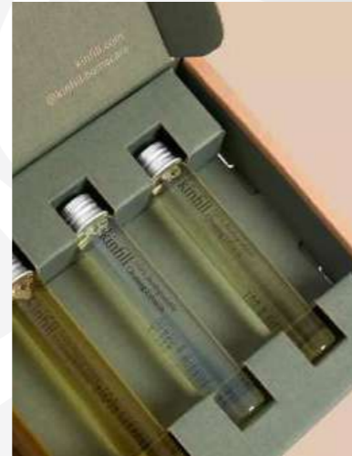
Colored Mailer Boxes