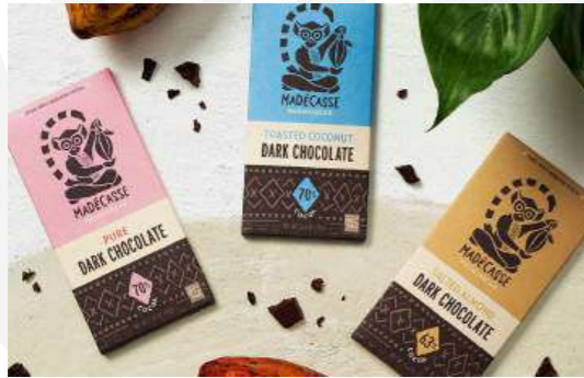
Chocolates Paper Wraps