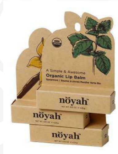
Kraft Hanger Box