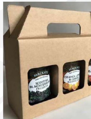
Kraft Gable Boxes