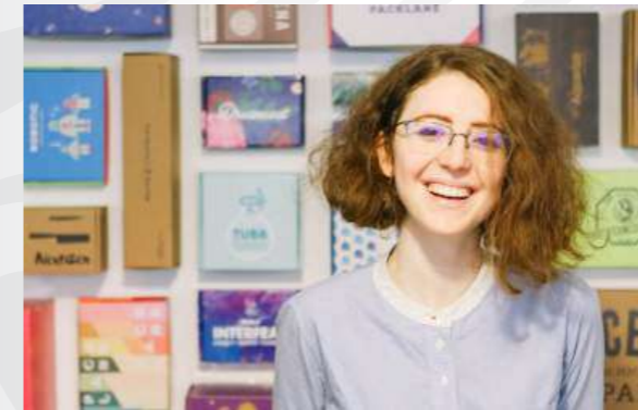
Versatile Box Materials