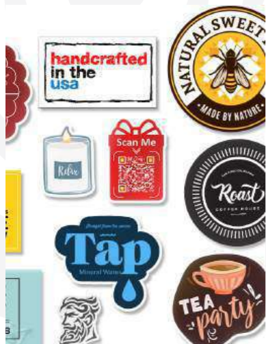
Custom Logo Decals