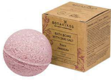
Kraft Bath Bomb Boxes