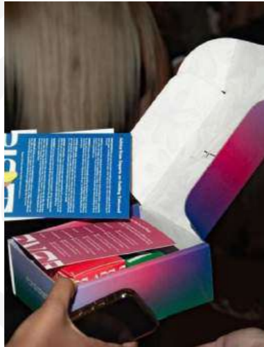
Custom Mailer Boxes