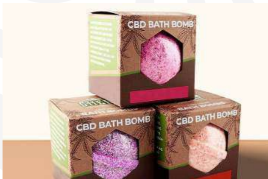
CBD Bath Bomb Boxes