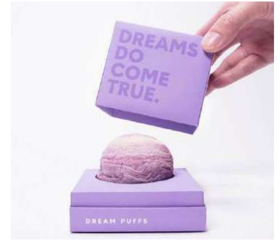
2 Piece Bath Bomb Boxes