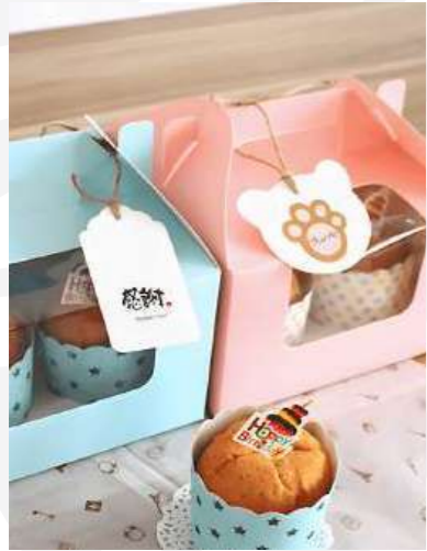
Gable Boxes + PVC

We can help you package cakes, donuts, cookies, cupcakes, and any other mouthwatering treat. Our paper food boxes are available in a variety of colors, including white, conventional pink, wrap-around windows, top windows, doughnut boxes, macaron boxes, and even boxes with top straps and edge windows that truly highlight your goods