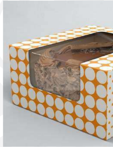
Cake Boxes + PVC