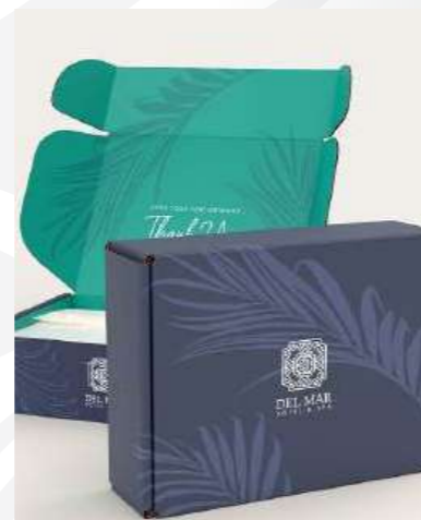
Tuck Top Mailer Boxes