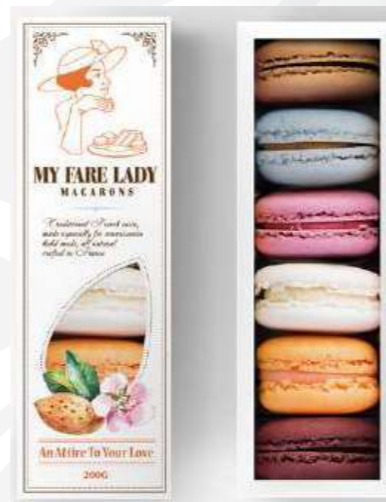
Luxury Macron Boxes