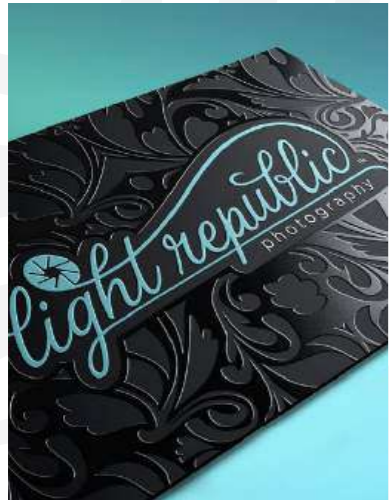
Spot UV Business Card