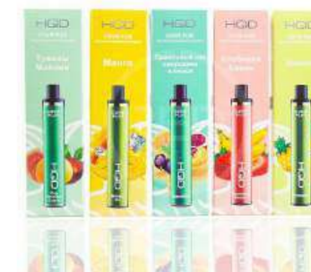
Premium Vape Box