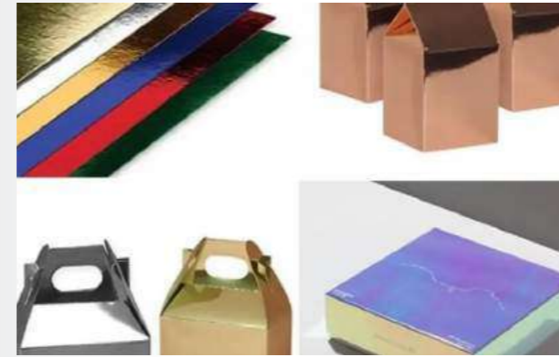
Metallic Card Stock