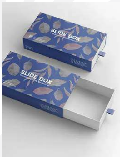
Slide Box Packaging