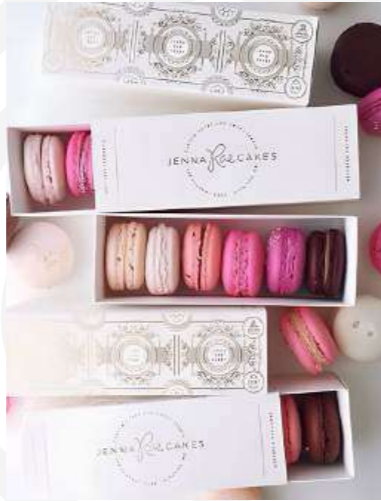
Sleeve Tray Boxes