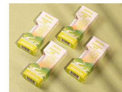
DieCut Vape Boxes