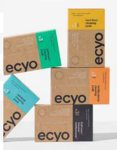
Kraft Soap Boxes

Eco-friendly options that align with your environment for a greener tomorrow. Let's upgrade your packaging game and attract more customers today with We Print Boxes!