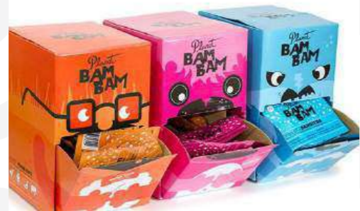
Gravity Dispenser Boxes