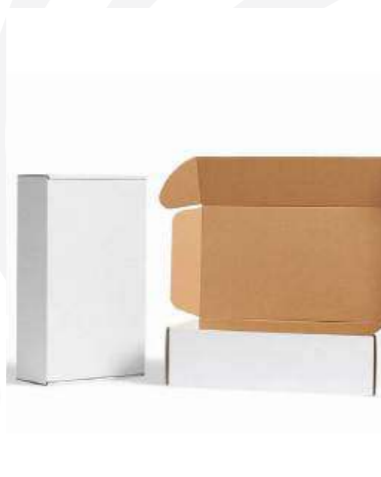
White Mailer Box