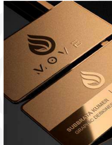
Gold Foil Business Card