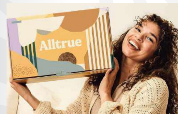
Retails Ship Boxes