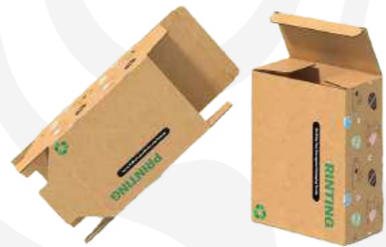
Kraft Snap Lock Boxes