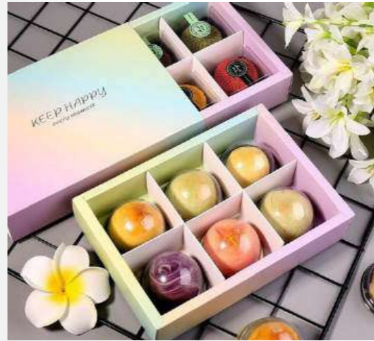
Luxury Bath Bomb Boxes

Boxify Design offers custom Bath Bomb Boxes with completely customized features. We prioritize transparency, sustainability, and customer satisfaction in brand identity while also highlighting compliance features and sustainable packaging. Customize it to fit your brand's voice and style. Our boxes are durable and reliable for every need and contain bath bombs, carefully crafted to provide a serene and calming experience.