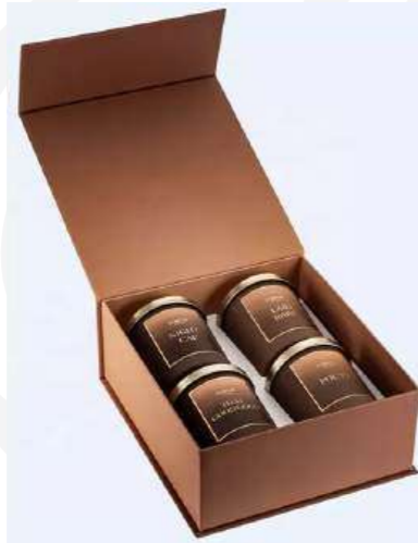
Rigid Candle Packaging