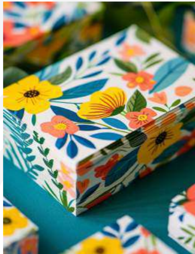
2 Side Printing