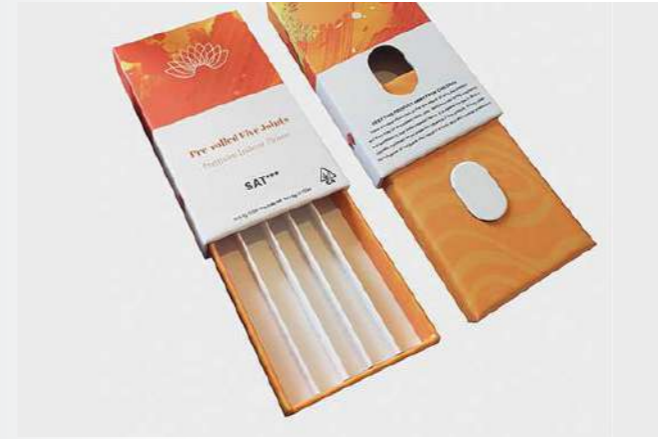
Child Resistant Boxes